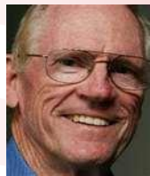
Menifee Mayor Wallace Edgerton (Menifee Only)