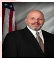
San Jacinto Mayor Scott Miller (San Jacinto Only)