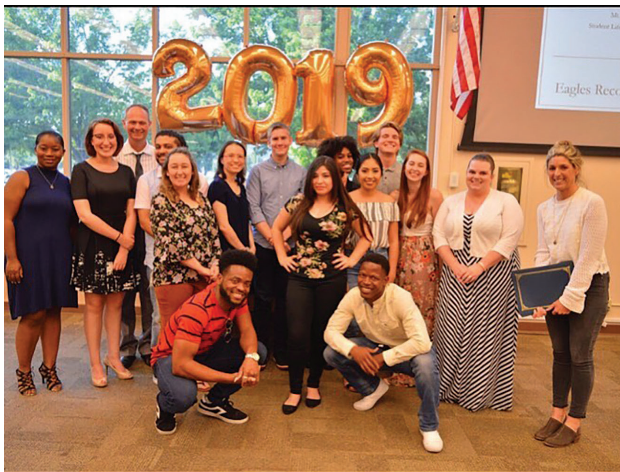
Phi Theta Kappa Officers Receives Leadership Awards

Members can also gain research and servant leadership skills by participating in Honors inn Action for their local chapter, be a part of a network of almost