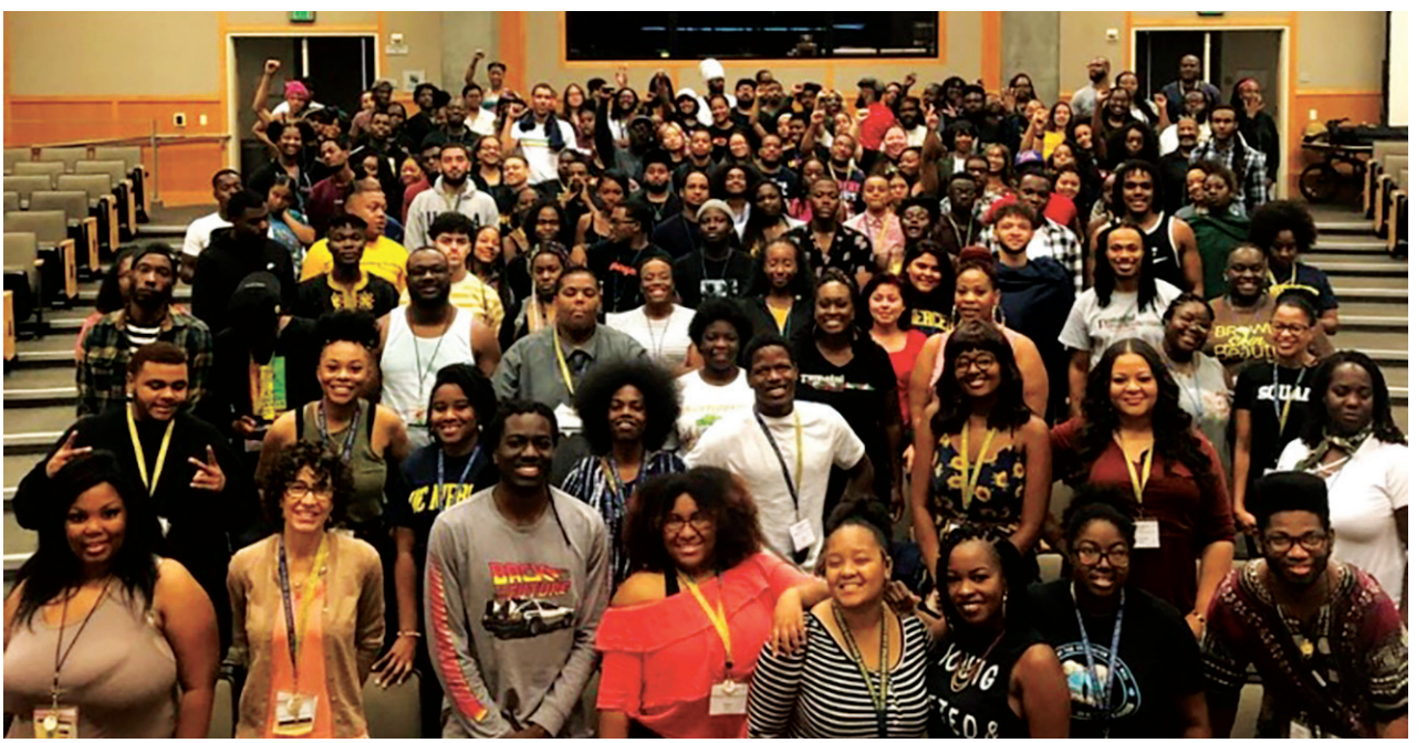
Photo of the attendees from the Umoja Leadership Summit in the summer of 2019.

“Umoja means community, unity and most importantly in my personal opinion, family. Umoja is