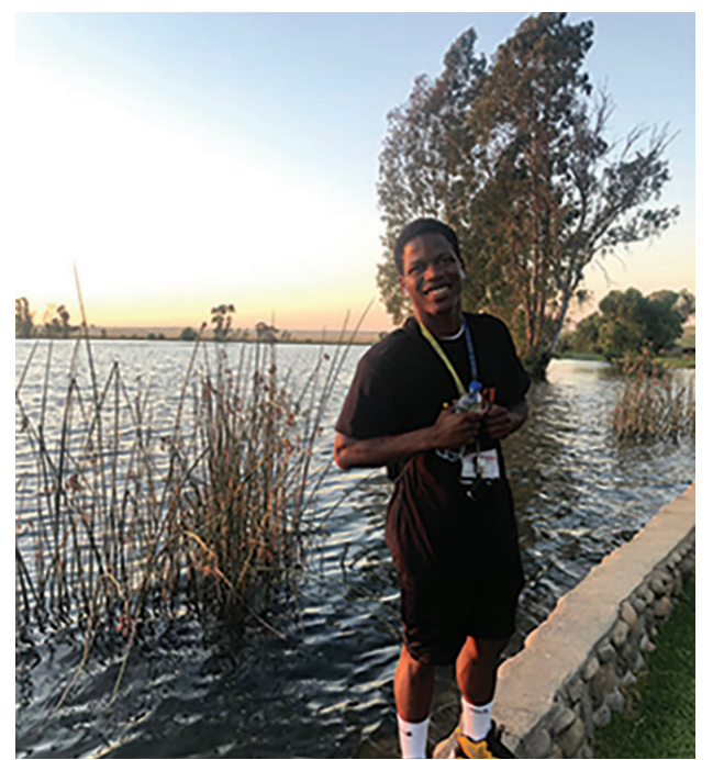
Fun at the Lake