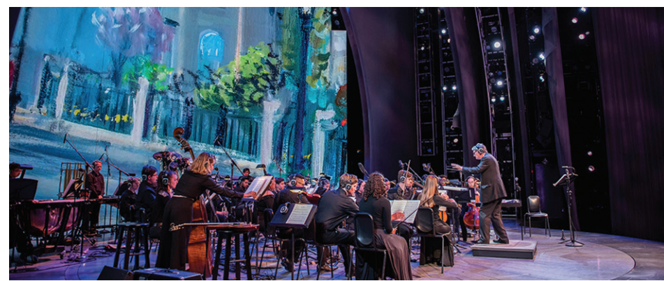
Disney's Performance Art Conservatory

Whether that emotion be good or bad, music will always make us