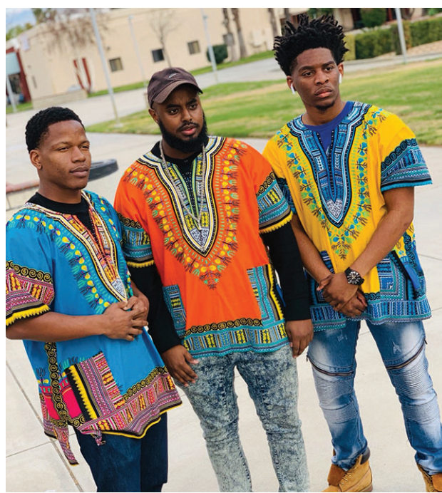
Representing styles of diversity for UMOJA