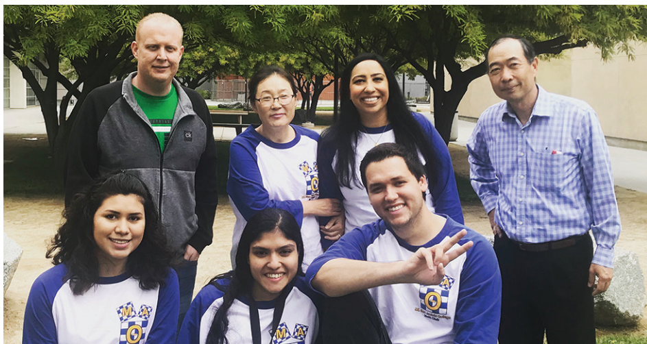
Mu Alpha Theta’s adviser and officers from Spring 2019.