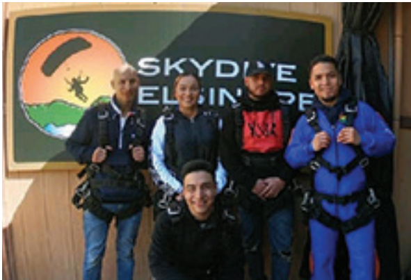
Lake Elsinore sky diving