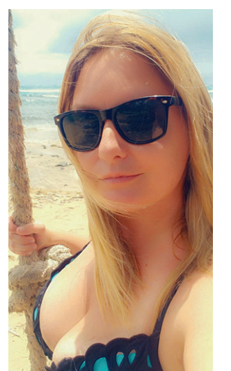
Beach Selfie