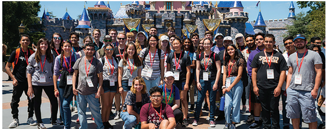
Disney Orchestra Performers at Disneyland