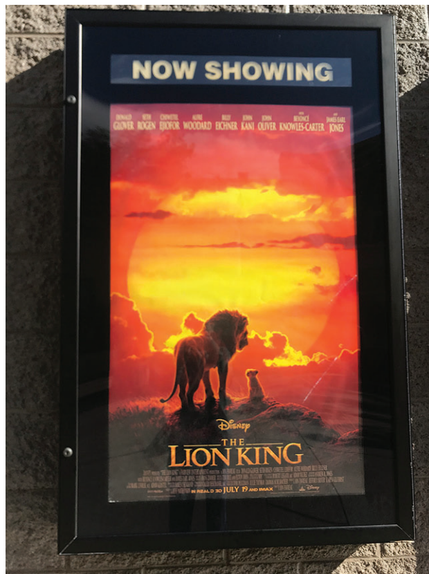
The Lion King

kept its fans on the edge of their seats as they laughed, and maybe even cried, throughout this fun, family friendly, live-action movie.