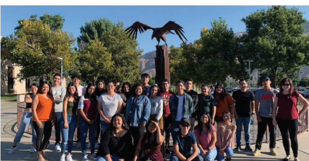
Fall 2019 Puente cohort