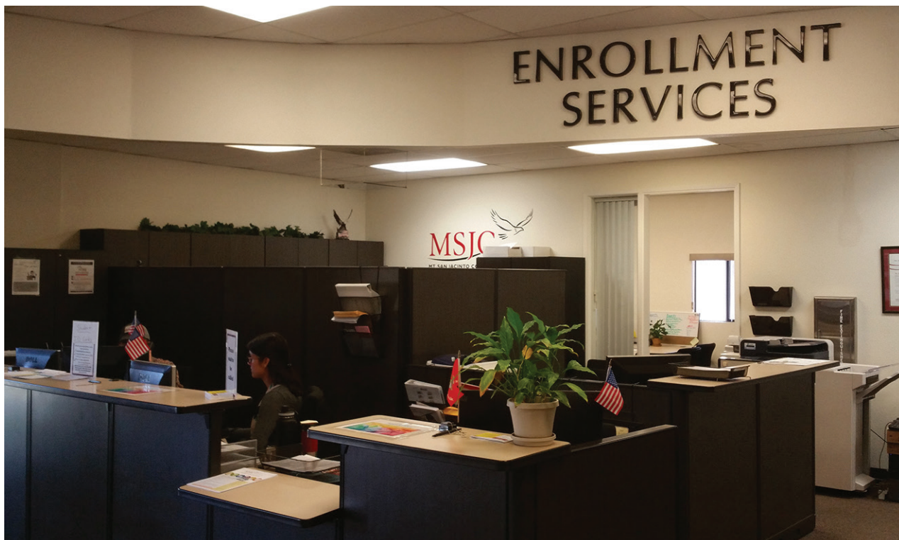
Enrollment Services provides the paperwork to apply to MSJC Promise