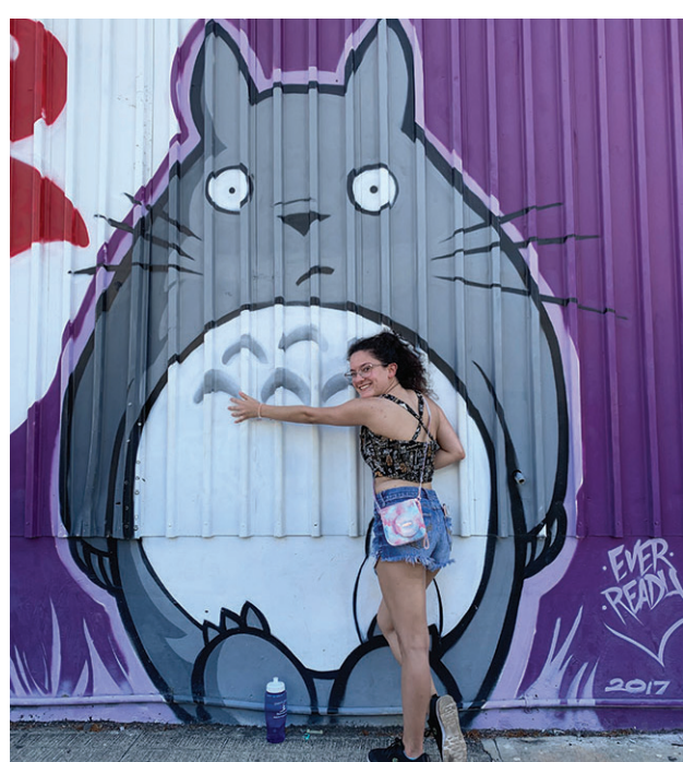
Hugging Totoro in Hawaii