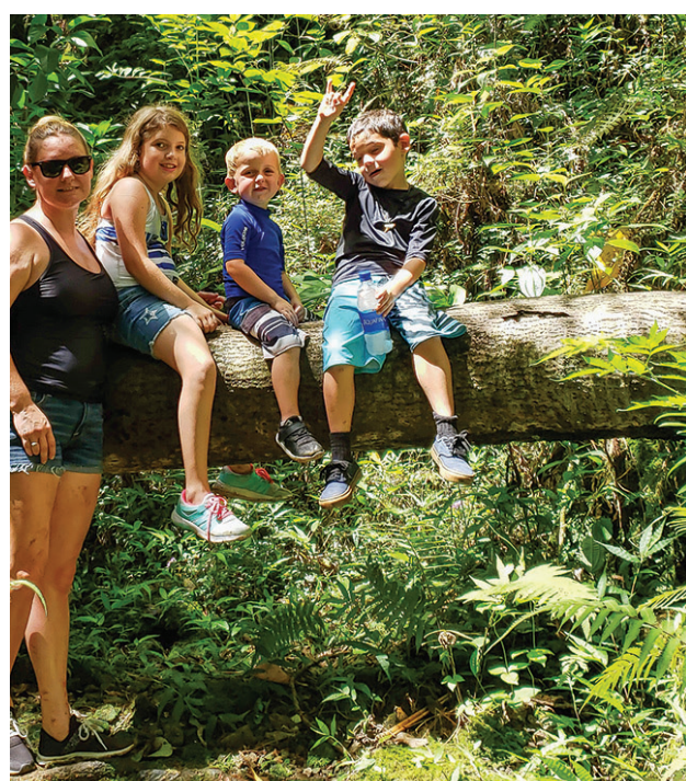
Hanging in Hawaii