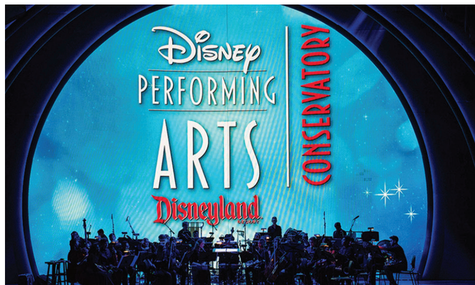
Disney's Performing Arts Conservatory

ing discouraged, because the one thing they wanted was a video of yourself playing grade three music. However, I decided to give it a chance anyway. I sent in my video, explaining why I play the violin left-handed, and I explained that I didn't have the same skill set as the other musicians but explained my yearning to learn and gain knowledge from this experience. A couple of weeks later, I got a call from the performing arts center. Turns out I was accepted! The Saturday before the conservatory started, I had encountered many problems with my violin. First, my bridge slipped. Then the bridge had snapped after resetting it. I was freaking out, thinking to myself, "what could've been". I saw my experience at the conservatory go straight out of the window. The next day I took my violin to a local shop hoping they could fix her before the conservatory began.