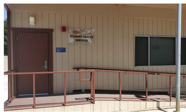
MSJC Health Center