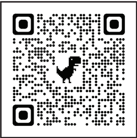
QR Code for IParq

Check the MSJC website at www.msjc.edu for updates on parking fees. To purchase your parking permit, go to https://msjc.thepermitstore.com .