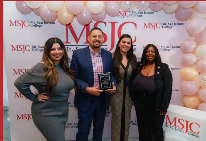
JPMorgan Chase Bank