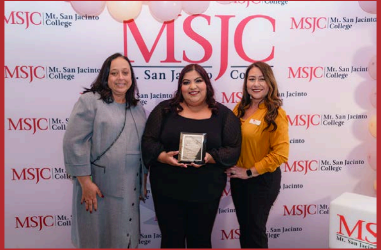
Menifee Union School District