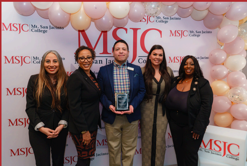
Cal Coast Credit Union