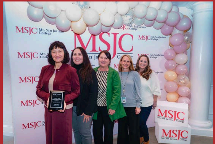
Murietta Valley Unified School District