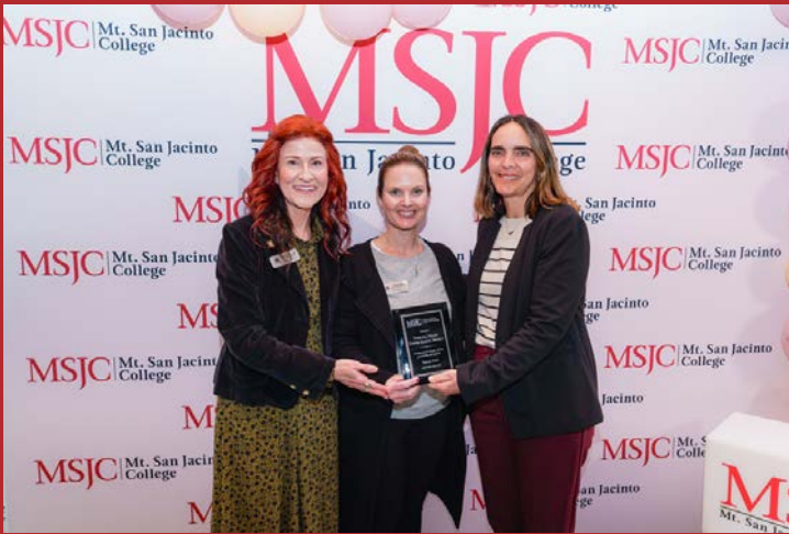
Temecula Valley Unified School District