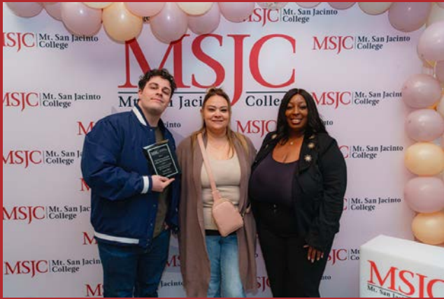
Center for Autism & Related Disorders