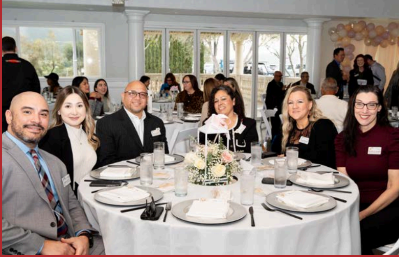
The Village Hemet