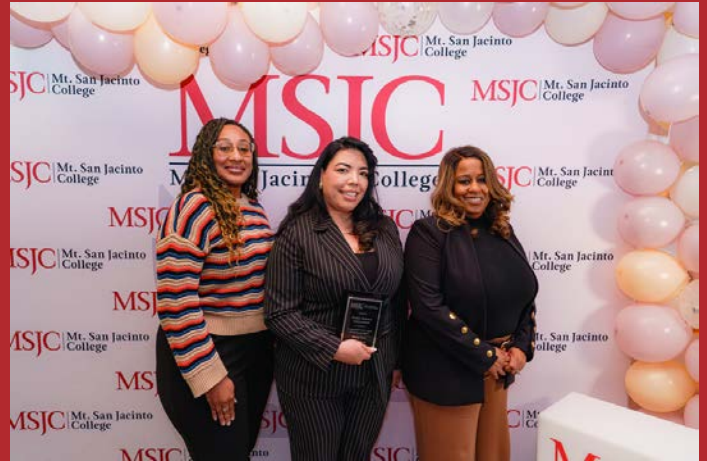
Family Association Services