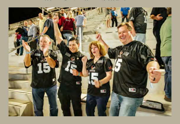
Eagles Football Plays First Game at the New Stadium