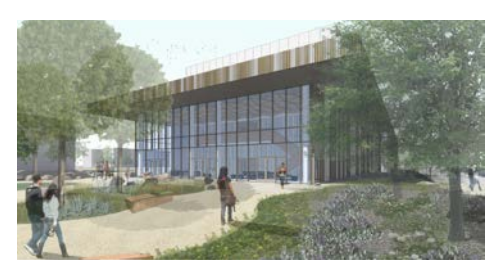
STEM Center San Jacinto Campus

For more information on Measure AA, scan the QR code: