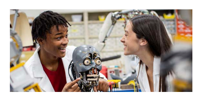
Fall Semester begins August 14