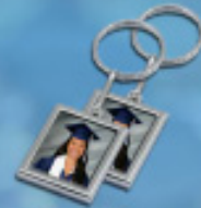
KEYCHAINS (2 keychains - includes photos)