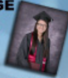
SENT TO YOUR EMAIL