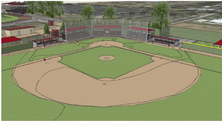
Renderings of Future Baseball Field and Gym