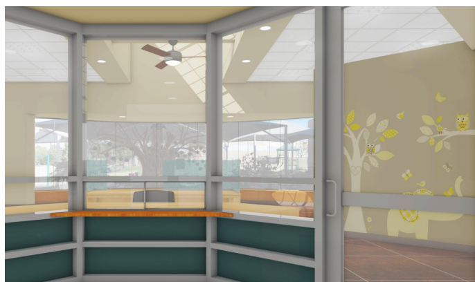
Renderings of Future MVC CDEC Entrance