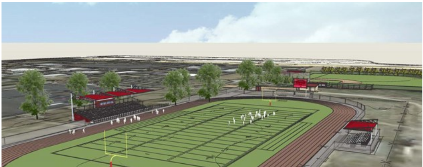
Renderings of Future Football Field and Track