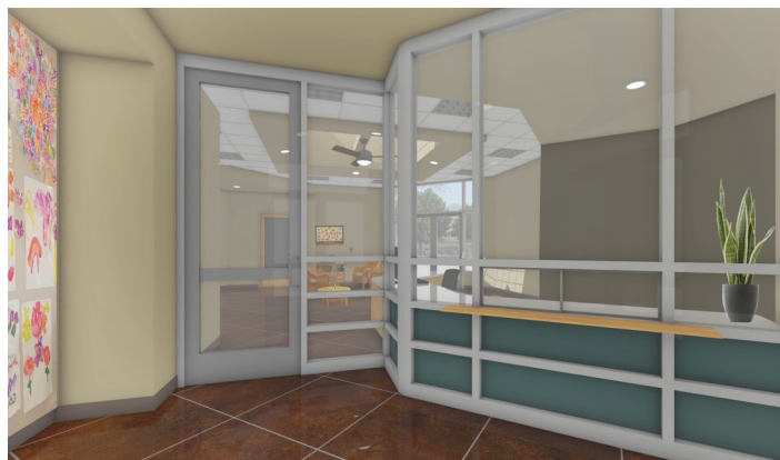
Renderings of Future SJC CDEC Entrance

On August 11, 2016 the Board of Trustee approved the contract for Ruhnau Ruhnau Clarke Architects for the safety and security upgrades at the Child Development & Education Centers on the San Jacinto and Menifee campuses. The enhancement include adding security control to the entry at each center, security hardware at the interior and exterior of classrooms, as well as accessibility upgrades in the parking lot for loading/unloading. The project is currently under design and will be completed in summer 2017.