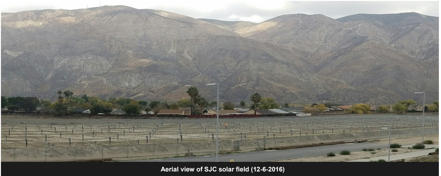
Aerial view of SJC solar field (12-6-2016)