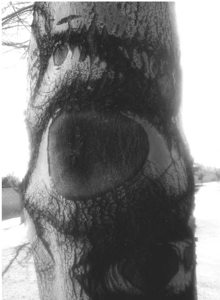
Lidia Melaku / Eye Sees You