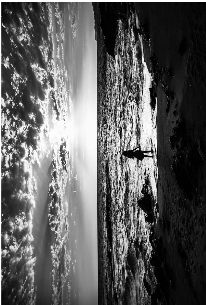
Ahjile Miller / Victoria Beach