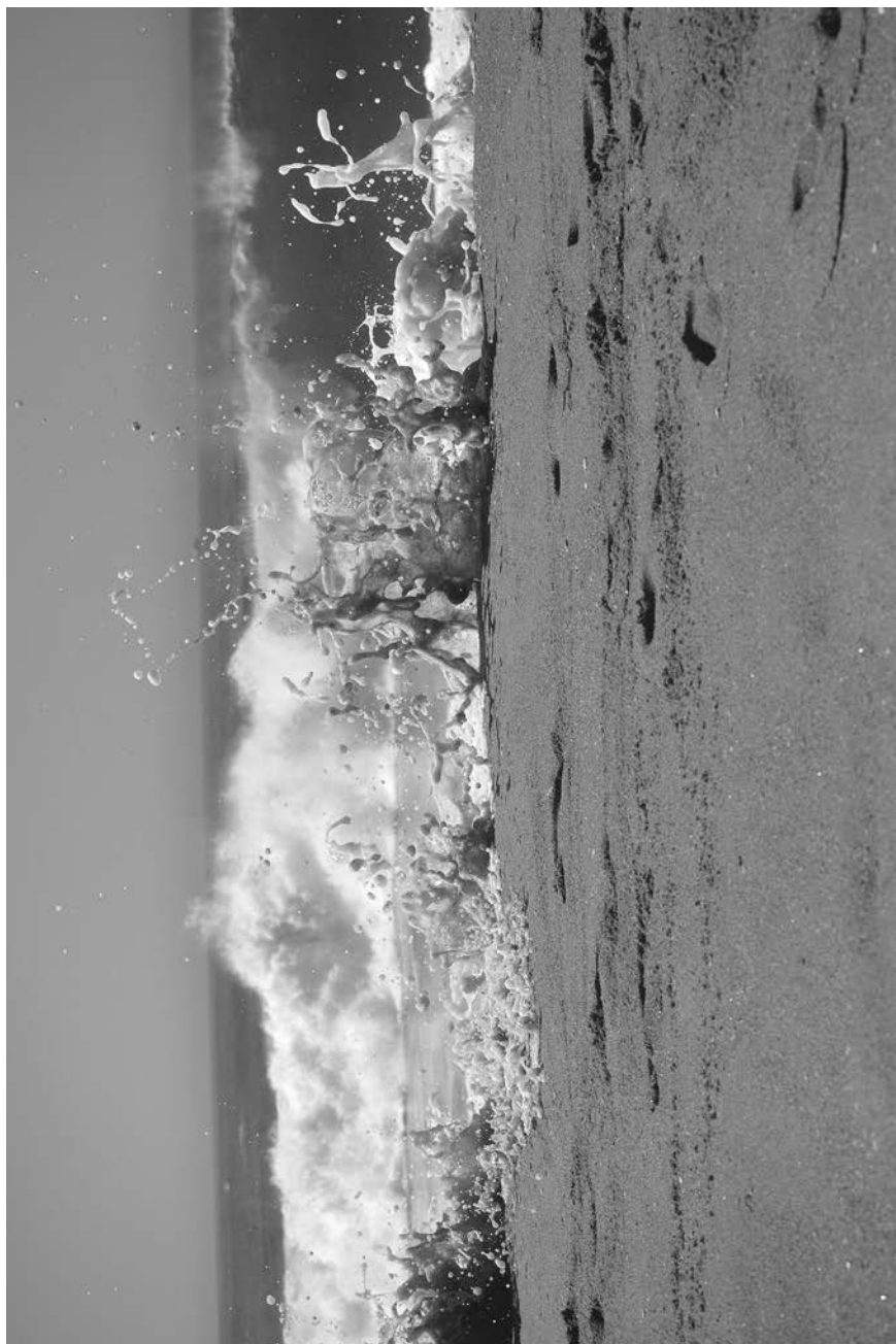
Daniel Biggs / Beach Splash