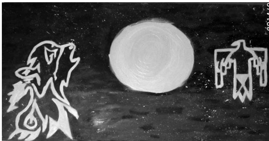
Crystal McGee / Wolf and Eagle at Night

Virginity is truly a beautiful and amazing gift It is something that is on the inside of all of us that can only be given away once and only to one person We cannot ever get this gift back no matter how hard we try It is a gift that we will remember giving away till the day we die