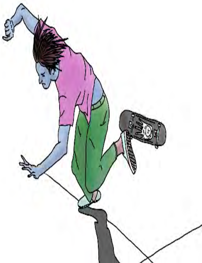
Ryan Spear / Winlose