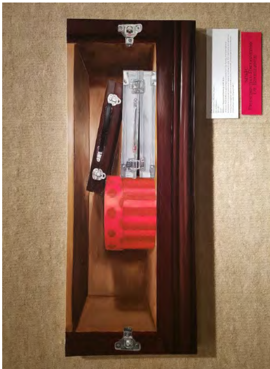
Mya Correa / Oil Painting