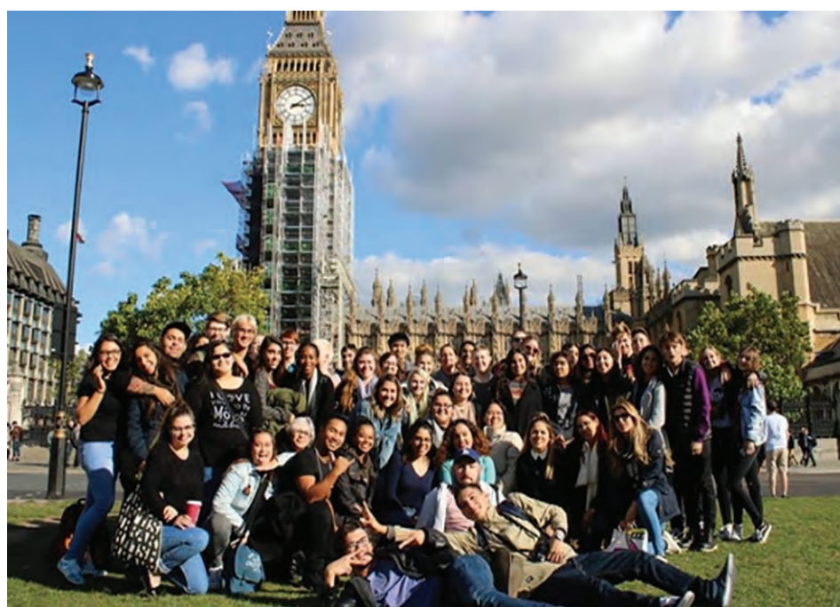
Students in the Study Abroad Program can visit London's landmarks.

Financial aid is on limited basis and is available through Citrus College. Citrus College should be added on the FAFSA for the 2019-2020 year and students should note that it will only assist with the expenses of the program. Students should also note they will need to enroll in Citrus College for the Fall