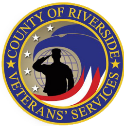
Riverside County Department of Veterans' Services